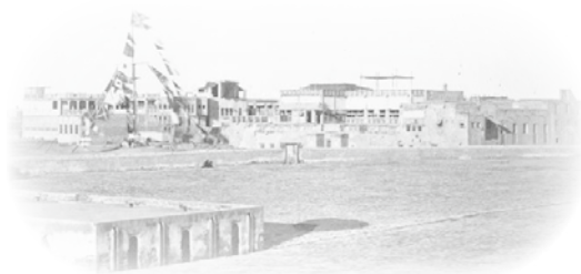
Entrance to the British residency in Bushire