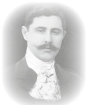
Marquess of Bute