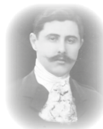
Marquess of Bute