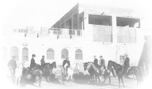
Residents in front of the British Post Office