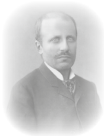
Philipp von Ferrari

Gibbons Start price in CHF Start price approx. €