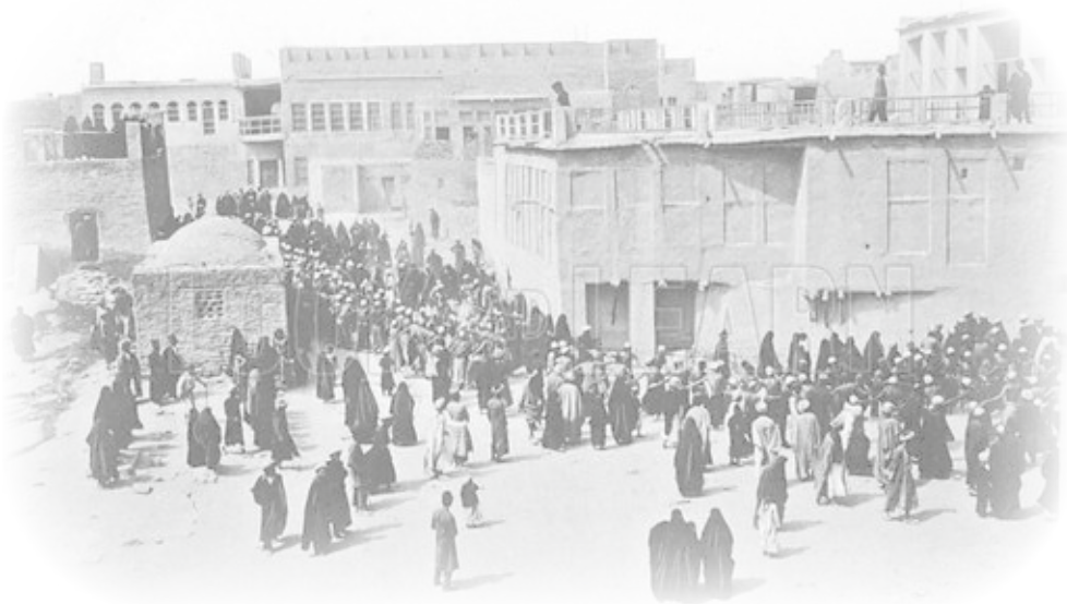
View of Bushire