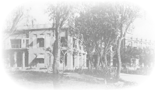
British Residency in Bushire

4588 Setting V. Coronation 1 ch. deep blue & carmine, an unused example, position 4, well centred and of fresh colour, superb and scarce with just 186 stamps overprinted from two Settings. Signed D*H. Cert. RPSL (1981) Gi = £ 1'400.