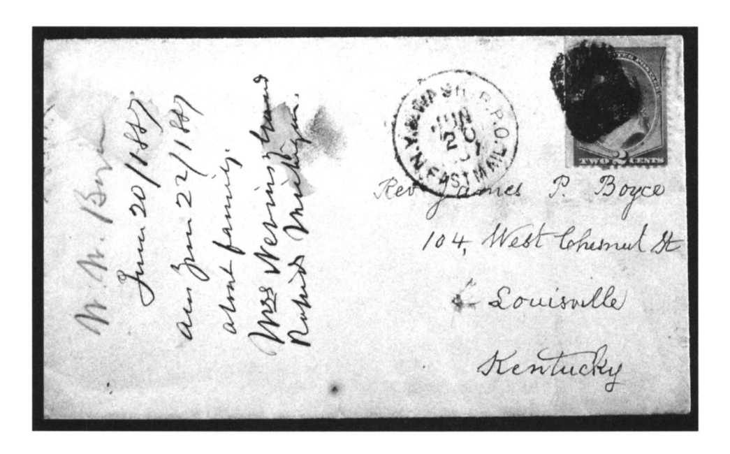
1887 railway post office fast mail cover to Louisville, Kentucky. A railway post office (RPO) was a rail-road car, usually on a passenger train, where mail was sorted en route to speed delivery. Sorting mail aboard moving trains revolutionized mail processing. Profits from RPO contracts helped railroads subsidize a number of otherwise unprofitable passenger routes. Note the abstract added to the cover by the recipient to aid in retrieval from a pigeonhole desk or bundled correspondence. Such abstracts aid in understanding recordkeeping practice in the 19th century.

cancellations such as geometrical figures like stars and concentric circles and organic designs like plant and animal forms, fraternal emblems, hearts, and shields. These uncommon and distinguishing stamp cancellations are of interest to many postal historians. Although U.S. postal regulations usually specified black ink for cancellations, some cities occasionally used red, blue, green, magenta, and, in extremely rare cases, orange or yellow.<sup>45</sup>