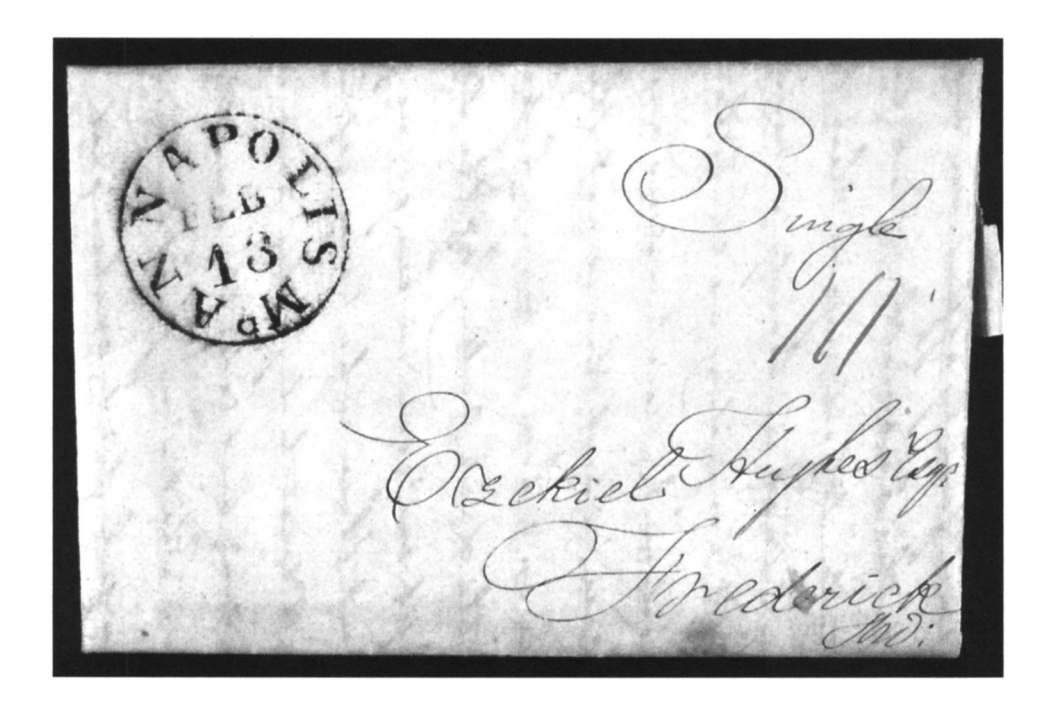
Stampless cover from Annapolis to Frederick, Maryland. Stampless covers are typically folded letters with wax seals mailed before the issuance of postage stamps in 1847 and before the use of stamps became mandatory in 1856. The originating post office wrote or hand stamped its city name. If the postage was collected at the time of mailing, the letter was marked PAID, if not, payment was collected at time of delivery.

The postal system has used a variety of markings to cancel stamps to confirm that the sender made proper payment for the mail's delivery and to ensure that postage stamps are not reused. These postmarks often indicate the time and place of origin, route, destination, and mode of transportation. Archivists should be aware of the more uncommon varieties that are of interest to philatelists and postal historians.<sup>41</sup> Noteworthy originating town marks include those of small towns, discontinued post offices, ghost towns, territories, manuscript cancels, and rural free delivery cancels. Some cancellations or cachets denote unusual post office locations like those in the air, aboard trains, buses, ships, and even on the sea floor.<sup>42</sup>