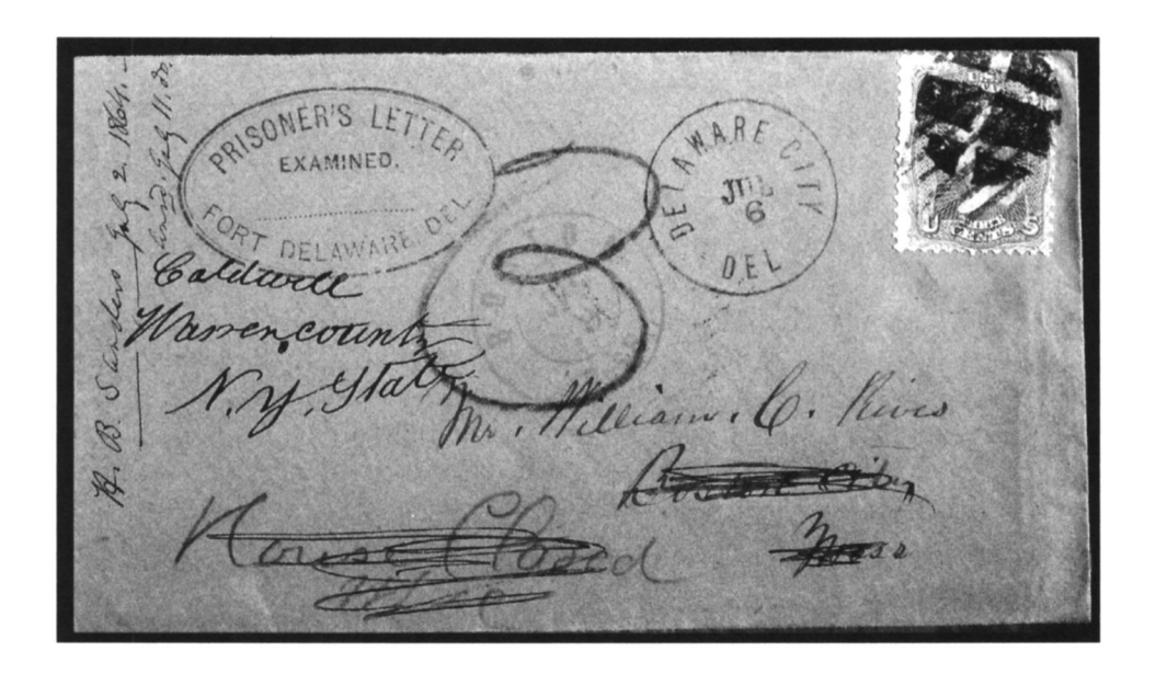
July 1864 prisoner of war cover from Fort Delaware, Maryland. A prisoner's cover was usually marked "examined" to note that prison officials had reviewed it.

The primary reference tools for describing archival collections are collection-level catalog records and finding aid inventories. Like other components of archival collections, philatelic materials should be described by group rather than item-by-item. In catalog records, archivists should employ controlled vocabulary subject terms and use scope and general content notes to identify significant collections with important philatelic materials. In inventories or other finding aids, more detailed scope and content notes can be employed to identify the series in which philatelic materials are found, to narrow the search to a small portion of a large collection.