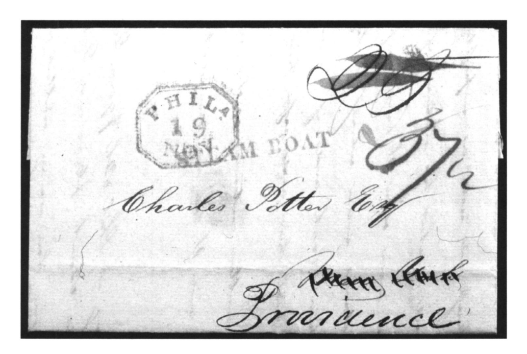
Steamboat cover from Philadelphia to Providence, Rhode Island. The U.S. Post Office officially recognized steamboat mail in 1825. The postmaster at the receiving post office paid the master of the steamboat two cents for each letter received, but this fee was not passed to the recipient. The steamboat hand stamp on this cover was in use from 1832 to 1852 and applied in was Providence where the letter entered the U.S. postal system.

Other markings indicate the covers traveled to remarkable destinations like the North Pole, the Antarctic, and the moon.<sup>43</sup> Cover markings (and some stamps) may indicate unusual means of conveyance such as via tin can, pneumatic post, balloon, inland waterway, packet boat, steamboat, pony express, early railroad or airmail, and rocket.<sup>44</sup> Some postal markings indicate the route the mail traveled and its destination. These receiving marks indicate how long the letter was in transit and any changes in the route taken.