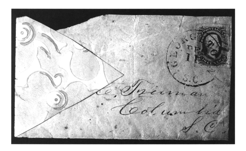
Confederate adversity cover made from wallpaper. By the end of the Civil War, paper was in short supply in the South. Letters and envelopes were fashioned from whatever was available including ledger sheets, printed circulars, maps, and book flyleaves and title pages.

cancellation marks.<sup>72</sup> Because 1,700 different philatelic books have been cataloged, the Library of Congress Subject Headings provides the best resource for controlled-vocabulary general subject terms to describe the wide variety of philatelic materials important to most postal historians. Since 2002, established LC subject headings may be used as genre headings in the 655 field. These headings contain an assortment of narrower subject terms under postage stamps and postal service and a limited number of narrower terms for cancellations, envelopes, and postal stationery.